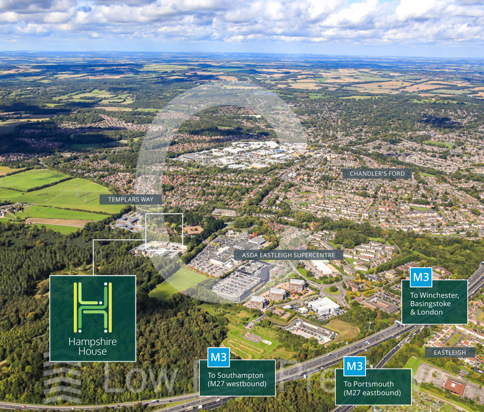
Looking north west over the M3 towards Hampshire House and Chandler's Ford in the distance.