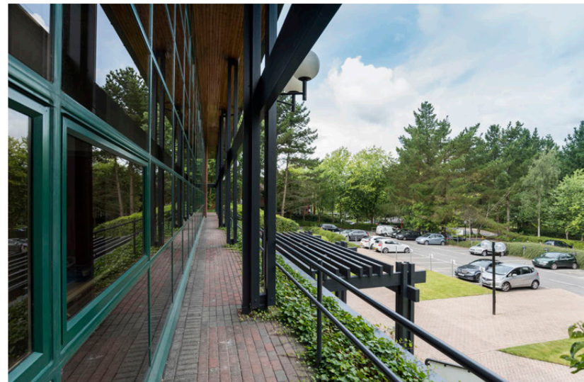
Top Left: Reception Above Left: Reception from the first floor Top Right: Central courtyard Above Right: View from the front elevation